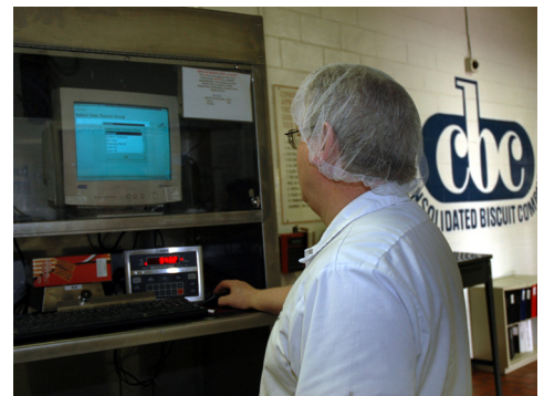
Portable workstations for measuring package weights

As the ideas developed, the possibilities did, too. Package labeling specifications should be accessible from the system so that the latest version was always available on the production floor. Pallet stacking diagrams should be accessible as well. Product lists should be line-specific, to speed the initial operator sign-in.